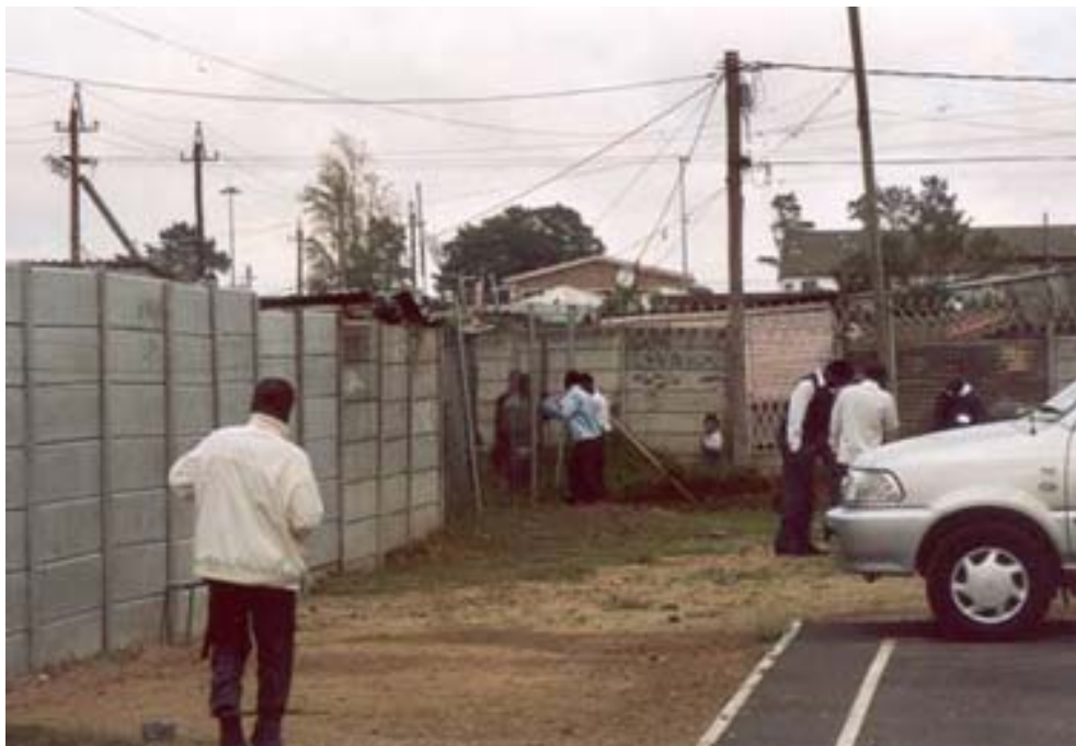
There was a part of us that wanted to go and break up the "goings on" of this drug dealer who was blatantly selling drugs to students through the fence at The Hector Pieterse School. Instead, on this day, we wisely decided to share the Gospel with the students rather than form a make-shift vigilante group and risk making a big mistake.